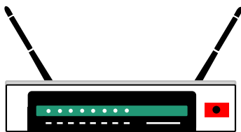
WIRELESS ACCESS POINT

Manage multiple wireless access points from a single web-based console.